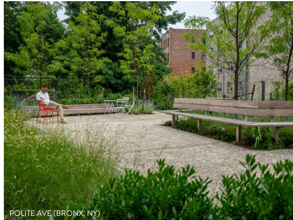
POLITE AVE (BRONX, NY)