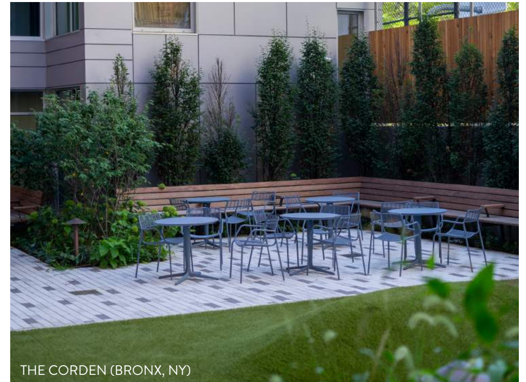
THE CORDEN (BRONX, NY)