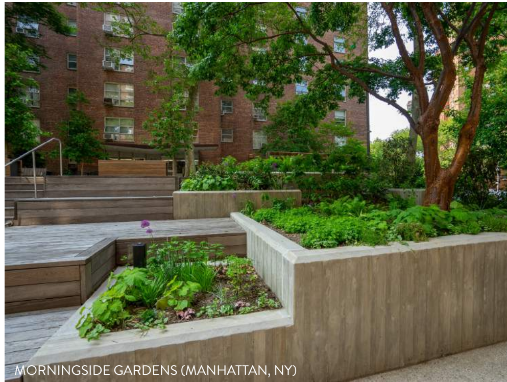
MORNINGSIDE GARDENS (MANHATTAN, NY)