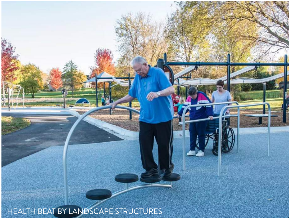
HEALTH BEAT BY LANDSCAPE STRUCTURES