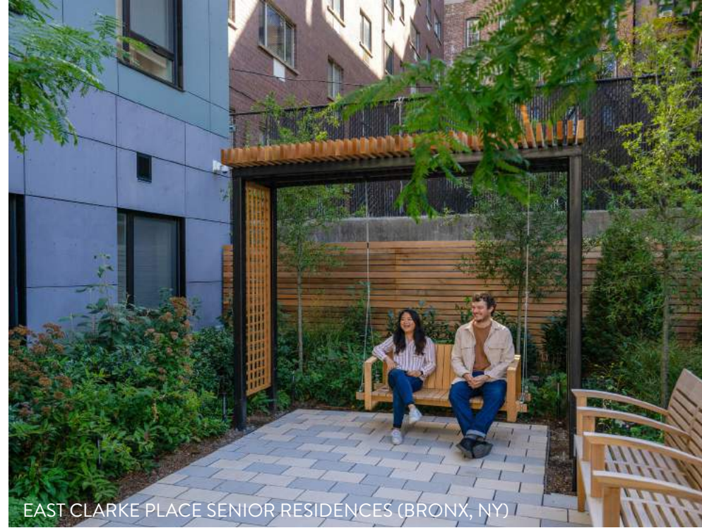
EAST CLARKE PLACE SENIOR RESIDENCES (BRONX, NY)