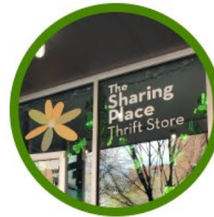
THE SHARING PLACE THRIFT STORE