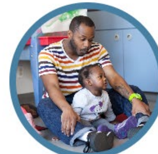
MENTAL HEALTH SERVICES