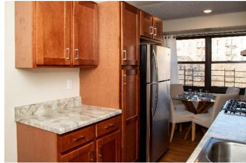
Renovated apartment at Twin Parks West