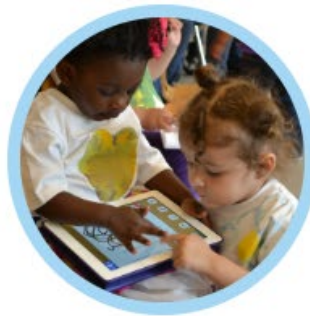
PARENTING AND CHILD DEVELOPMENT