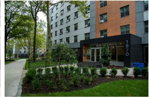
Site improvements at Baychester