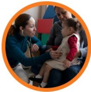
MATERNAL INFANT HEALTH