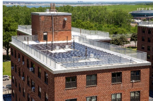
Repaired roof and solar panel system at Ocean Bay (Bayside)