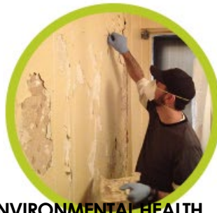
ENVIRONMENTAL HEALTH SERVICES