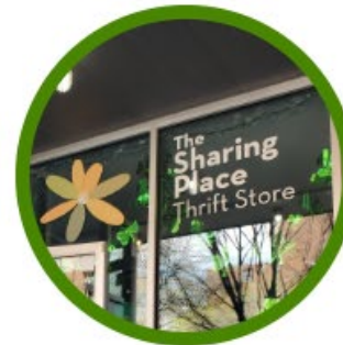
THE SHARING PLACE THRIFT STORE