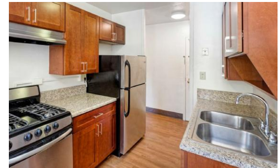
Ocean Bay (Bayside)