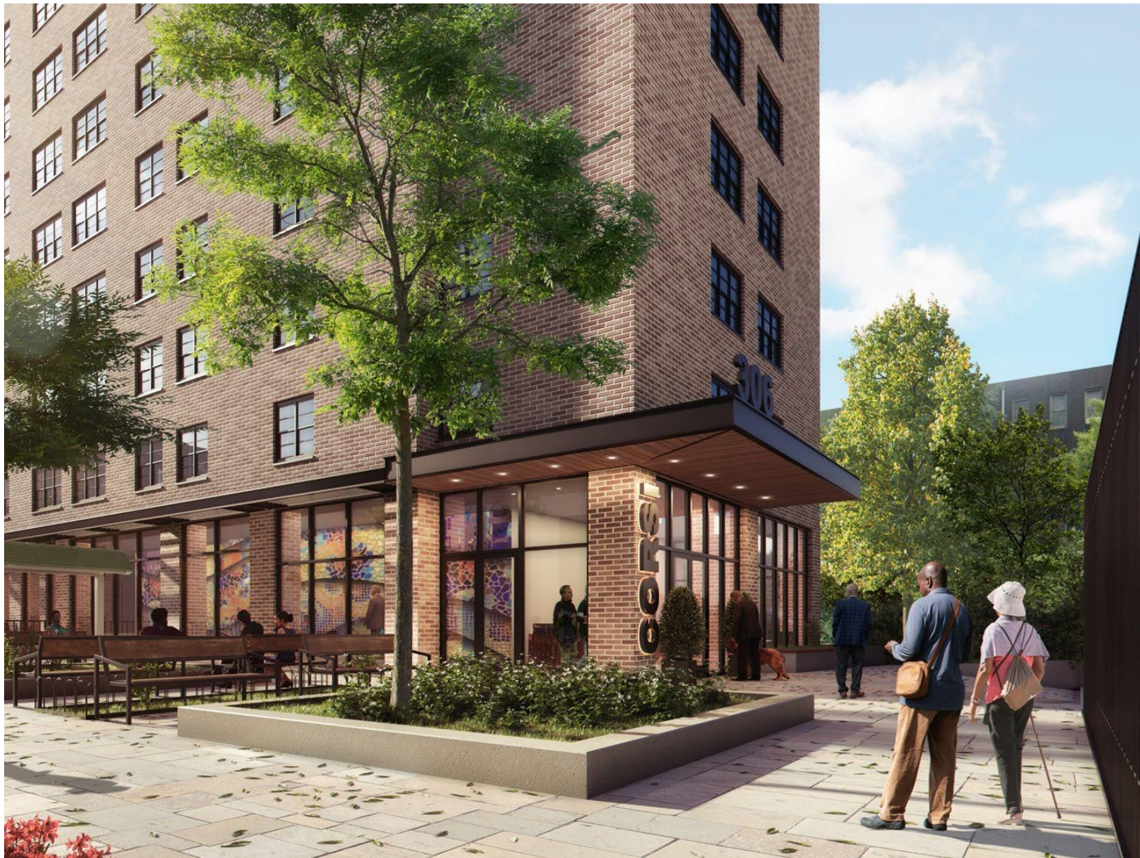
Lobby entrance, open outdoor space, fenced perimeter *Image for illustrative purposes only, final design subject to approval.*